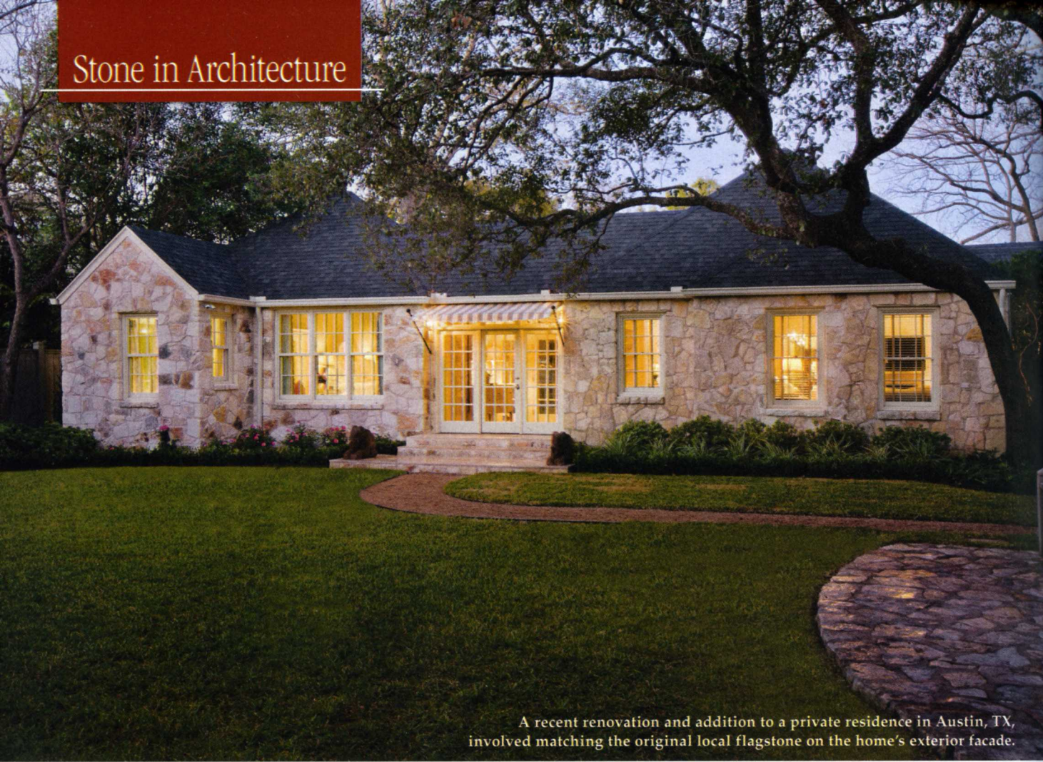
A recent renovation and addition to a private residence in Austin, TX, involved matching the original local flagstone on the home's exterior facade.