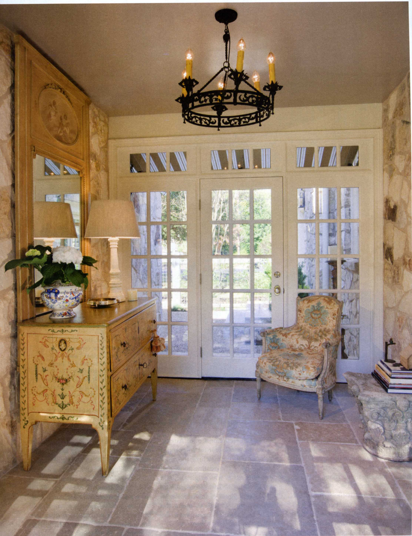
The renovation involved creating an entry foyer in the residence.