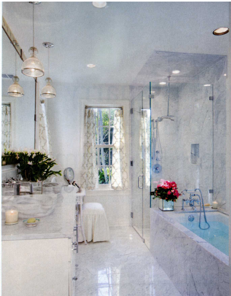
The addition also included building a master suite with a lavish master bath dressed in Italian marble. Slabs of Bianco Gioia marble — supplied by Architectural Tile & Stone of Austin, TX — were employed for the showers walls, tub surround, vanity top and backsplash. The material was also used in 12- x 12-inch tiles for the floor.

Tile & Stone of Austin, TX — were employed for the showers walls, tub surround, vanity top and backsplash. The material was also used in 12- x 12-inch tiles for the floor. Completing the look are dual washbasin sinks that are made from salvaged and re-utilized marble.